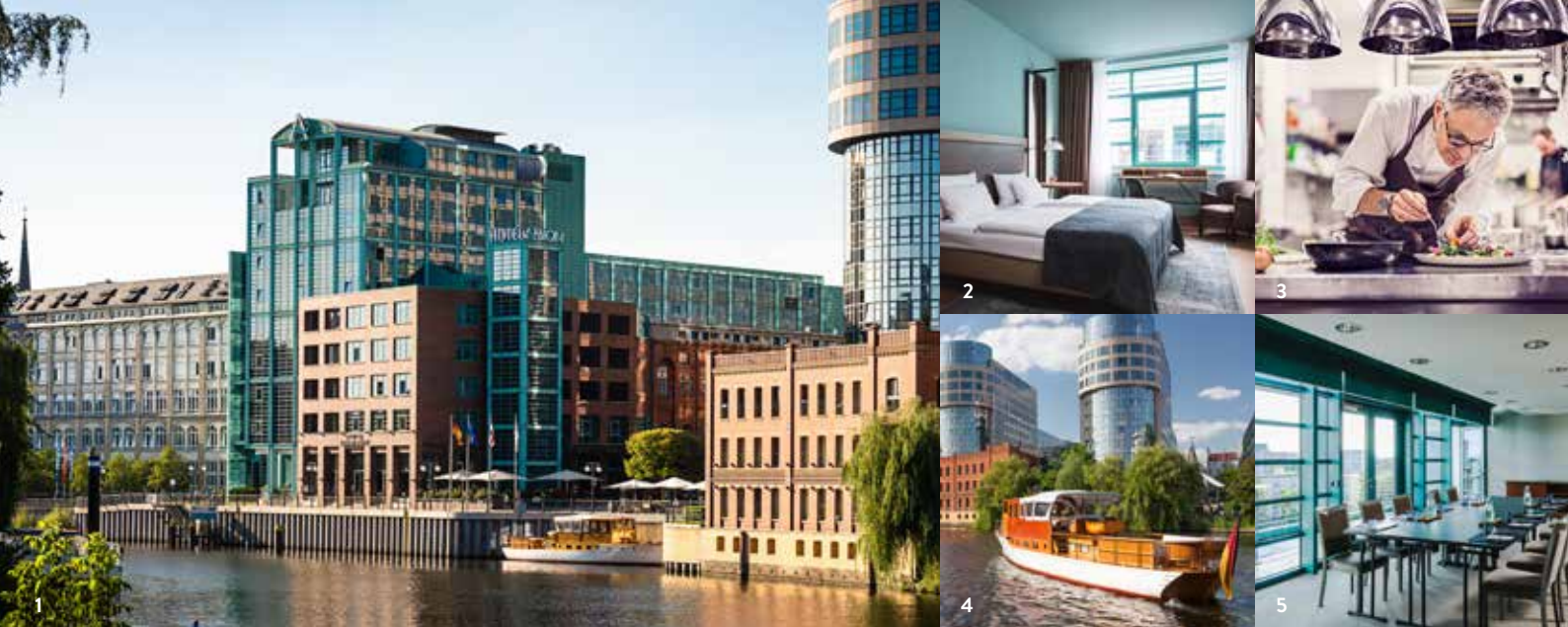
1 ABION Hotel | 2 Rooms at the ABION Hotel | 3 CARL & SOPHIE Spree Restaurant | 4 ABION YACHT | 5 Conference room at the ABION Hotel