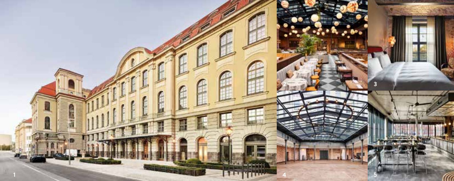
1 Hotel Telegraphenamt | 2 ROOT Restaurant | 3 Rooms with a View Hotel Telegraphenamt | 4 Event Location Kutscherhof | 5 Dieselhaus Gastronomie